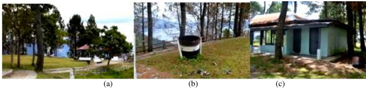
Figure 3. Public Facilities in Sipinsur (a) Pedestrian Path, (b) waste container, (c) toilet

“Bakkara is very beautiful and potential, but the facility not support enough for tourist, and Government have responsibility to develop Bakkara, such as sidewalks, the roads, trash and then Environment in Lake Toba.” (Key Respondent : Tourism Expert)