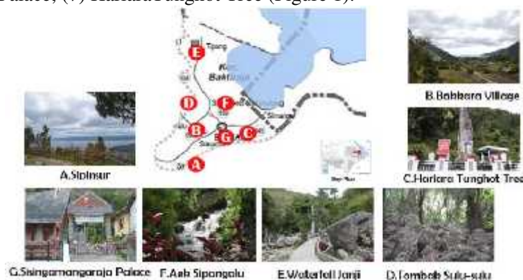
Figure 1. Research Area

Lake Toba has a beautiful panorama, cultural and biological diversity, and the type of rock that is extraordinary, but this potency has not managed properly. There are ten tourism destinations which highly capable of representing Tourism Caldera that has been set by acceleration team filing Geopark Caldera Toba. One of those is Bakkara Geopark Sibandang. The research location is in Bakkara district Humbang Hasundutan, which has the charm of unspoiled nature. The attractions contained in this caldera remain unexplored. Panorama Bakkara still has a good condition and natural with the activity of the local community. Most of the citizen working as a farmer, and the area was chosen because of geo area the only untapped and has a high potential. Bakkara has a diversity of potency attractions, i.e. (1) Janji Waterfall; (2) Aek Sipangolu; (3) Tombak Sulu-sulu; (4) Bakkara Village; (5) Sipinsur; (6) Sisingamangaraja Palace; (7) Hariara Tunghot Tree (Figure 1).